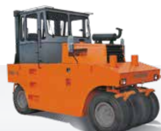
Serie GRW 15