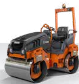
Serie HD CompactLine